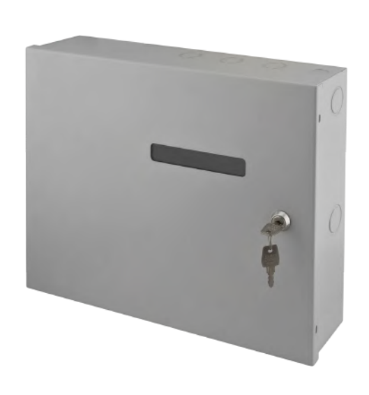
Set of cables included