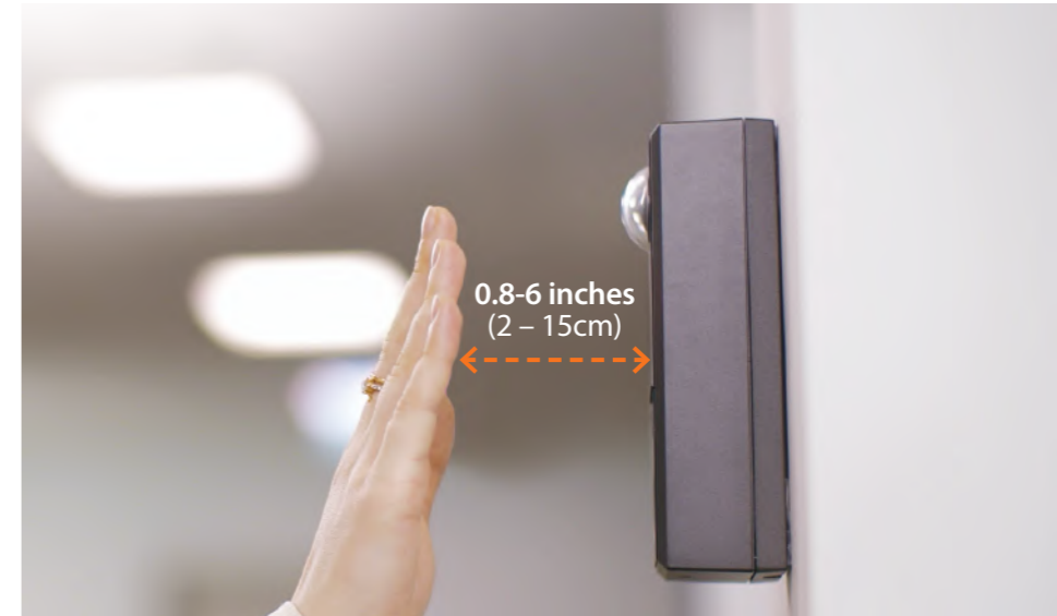
* It also offers a push-button call

The ToF sensor of TID-600R allows touchless call, where users simply present their palm within 6 inches of the station to initiate a call. Touchless system is getting more and more important especially when there's a highly contagious diseases and outbreaks. Keep your staff and visitors safe.