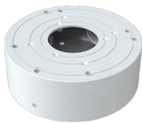
PR-JB12IP64 Small Junction Box