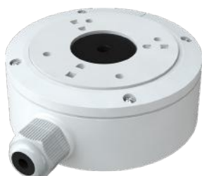
PR-JB12IP66 Small Water-proof Junction Box