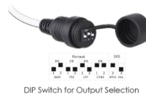
DIP Switch for Output Selection