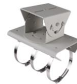
DS-1214ZJ Pole Mounting Bracket