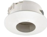
SHP-1680F / SHP-1680FW