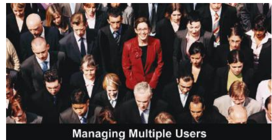
Managing Multiple Users